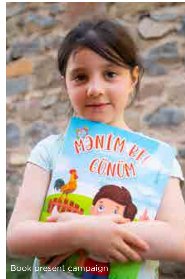
Book present campaign