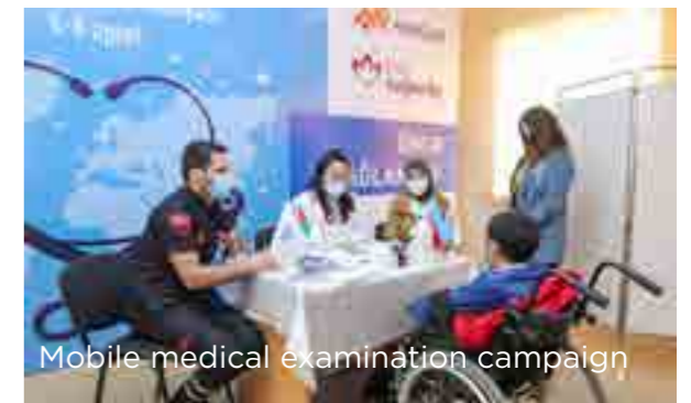
Mobile medical examination campaign