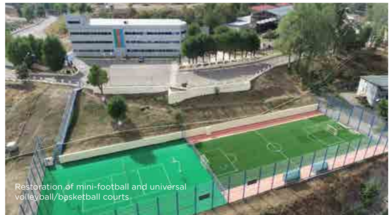
Restoration of mini-football and universal volleyball/basketball courts