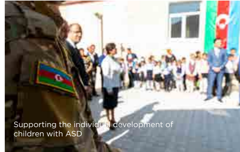
Supporting the individual development of children with ASD