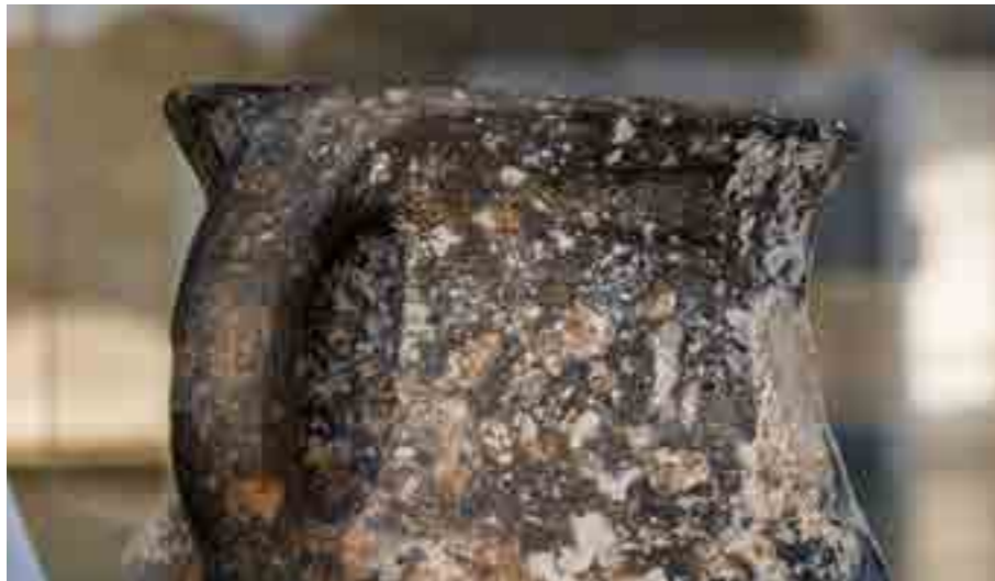
Artifacts discovered in the Chovdar necropolis in the Stone Chronicle Museum exposition