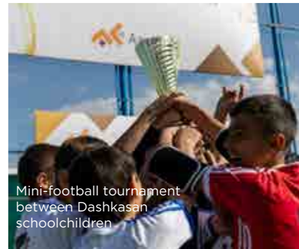
Mini-football tournament between Dashkasan schoolchildren