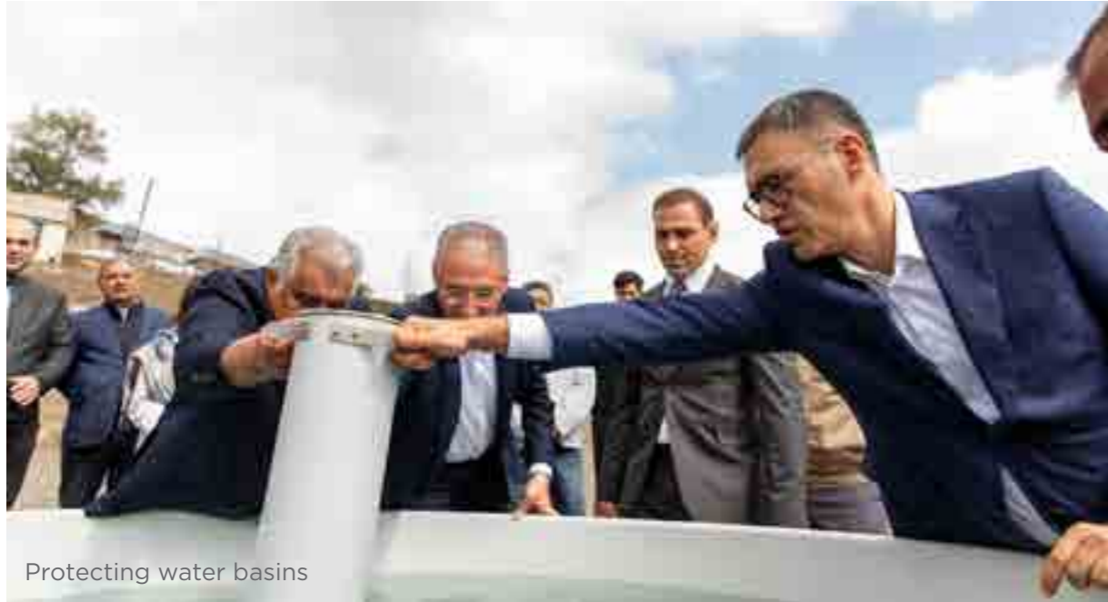
Protecting water basins