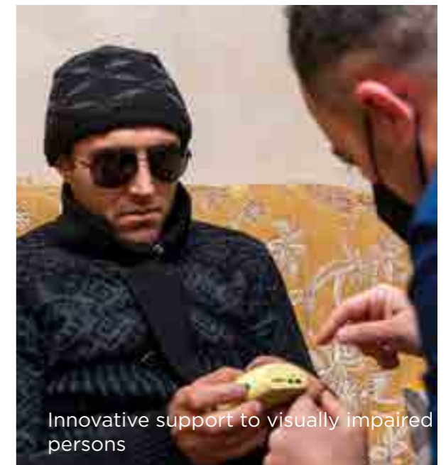
Innovative support to visually impaired persons