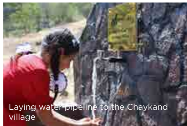
Laying water pipeline to the Chaykand village