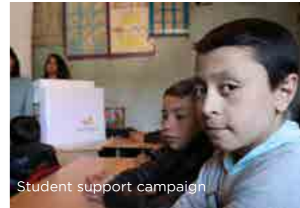
Student support campaign