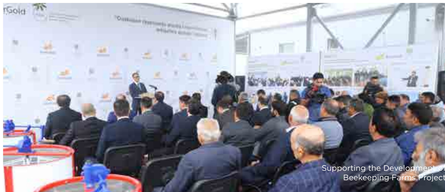
Supporting the Development of Beekeeping Farms Project