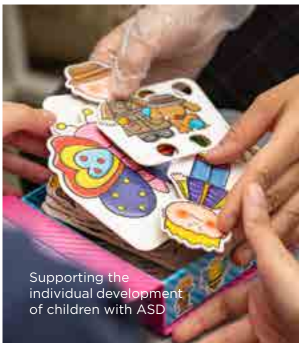
Supporting the individual development of children with ASD