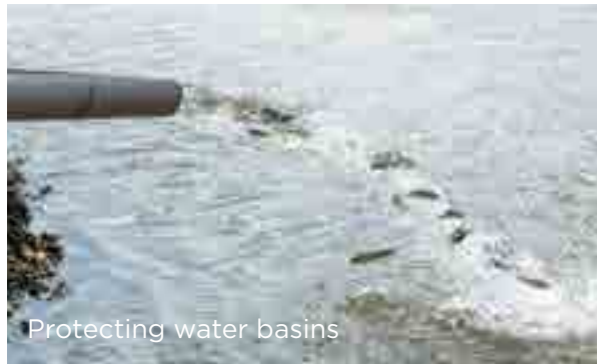
Protecting water basins