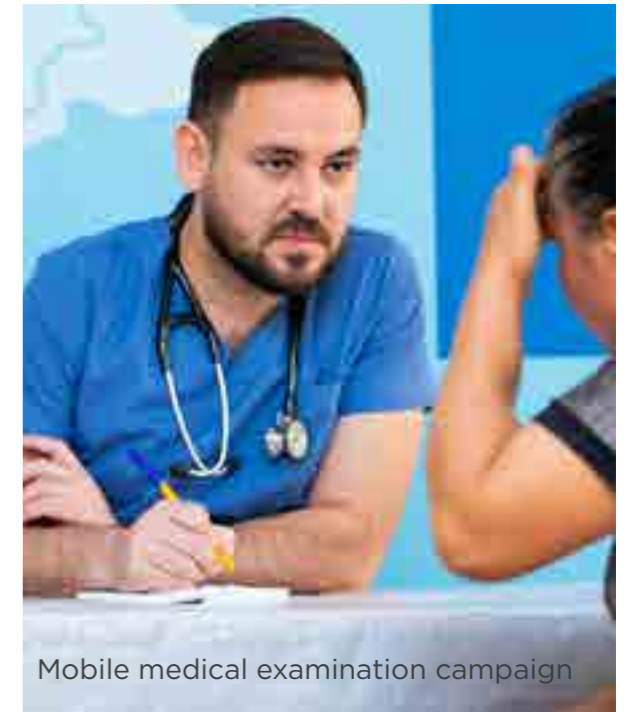
Mobile medical examination campaign