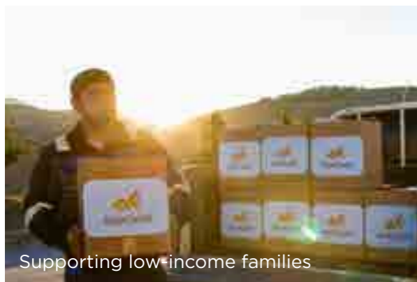
Supporting low income families