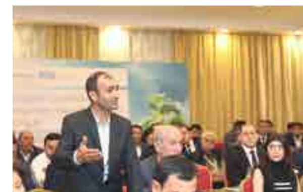
Training in Adaptation of Private Agricultural Farms to Climate Changes